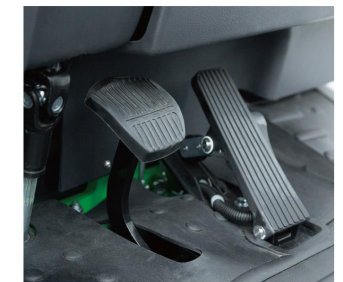
Pedals with comfortable angle