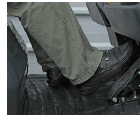
Large foot space