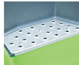
Low and Wide Step