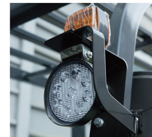
LED lights: energy saving, long life