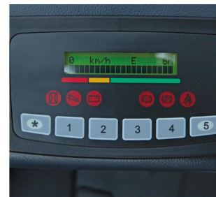
ZAPI controller with multifunctional instrument panel